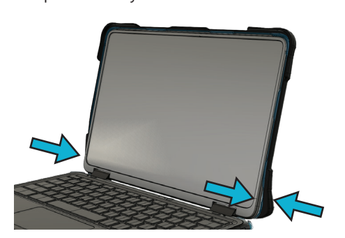
Congratulations on your new case!

Press the lower side clips over the device, with pressure from both sides, to snap into place securely.